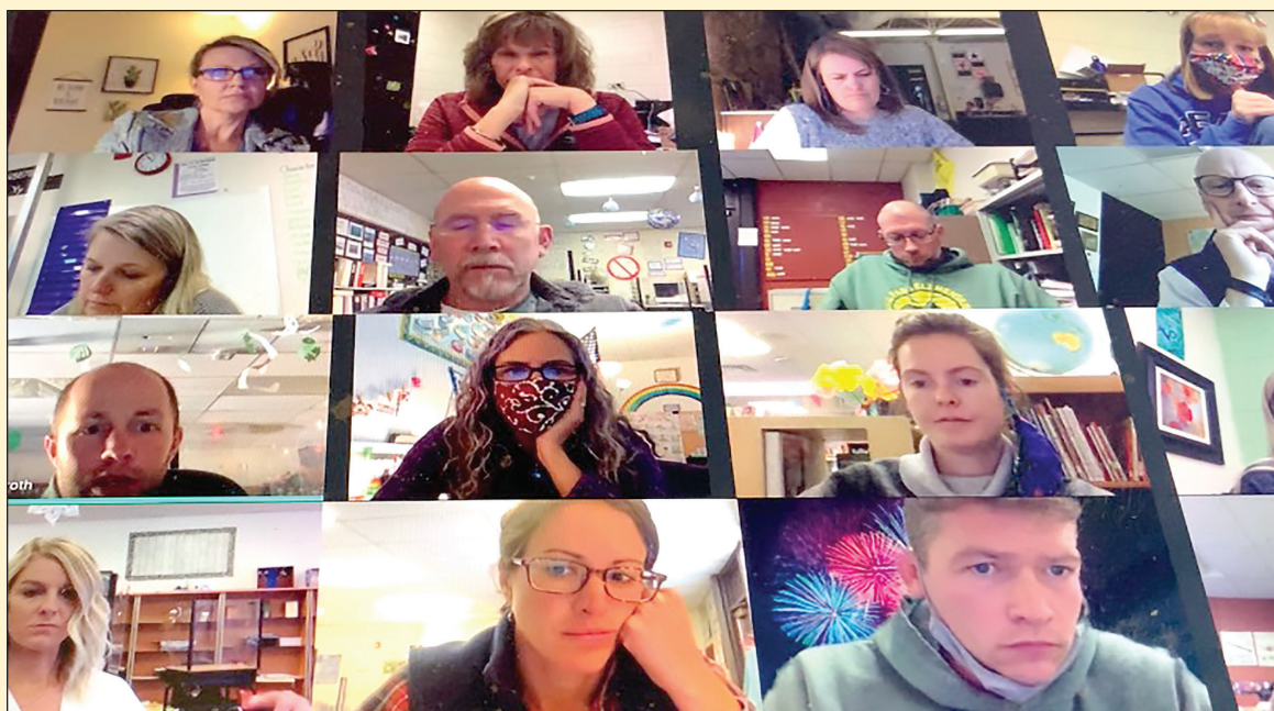
Ute Pass Elementary School staff met via Google Meet to discuss plans for the second semester.